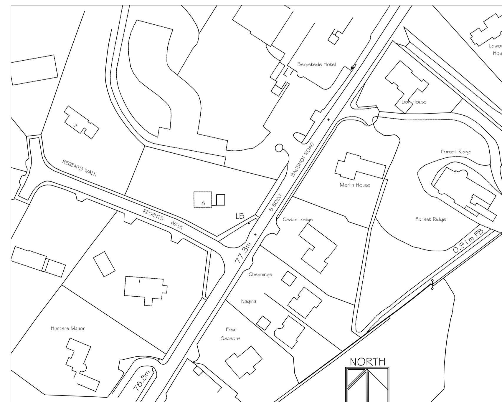
LOCATION PLAN Scale 1 : 1250